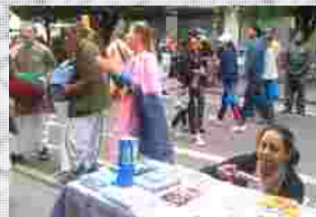
Harinam and simple stalls make an explosive combination!

'Jai Srila Prabhupada!' Simply books written by Srila Prabhupada, Prashadam, and Harinam in the mood of cooperation not corporation and immediately bliss, ecstasy were felt, freed from the modes and no anxiety. No small wonder Srila Prabhupada instructed Tribuvanath Prabhu to preach through festivals. It all seemed so simple. Chant and be happy, in effect.