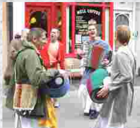
Harinam on the streets of London